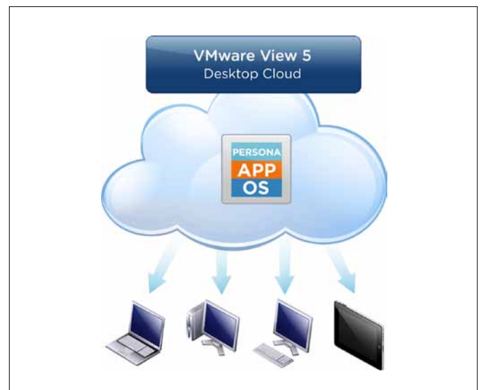
VMware View improves desktop and application management by delivering desktop services from your cloud to enable end users over any network on any device.

Enable a seamless end-user experience across sessions by maintaining the user persona with faster login times. View Persona Management also reduces costs by enabling more cost-efficient, stateless floating desktops.